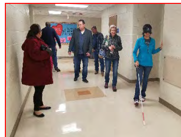
Family member under eye cover uses a white cane to navigate a hallway, as others watch.