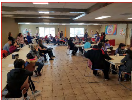
View of the students and families in the dining hall prior to the competition.