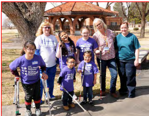
Group photo of the Enrichment students