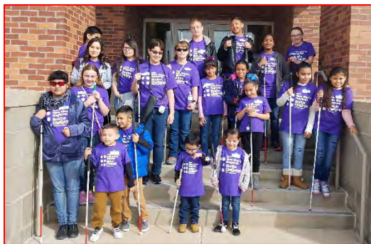
Group photo of the Braille Challenge students